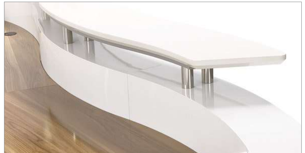
Jade white stone hob