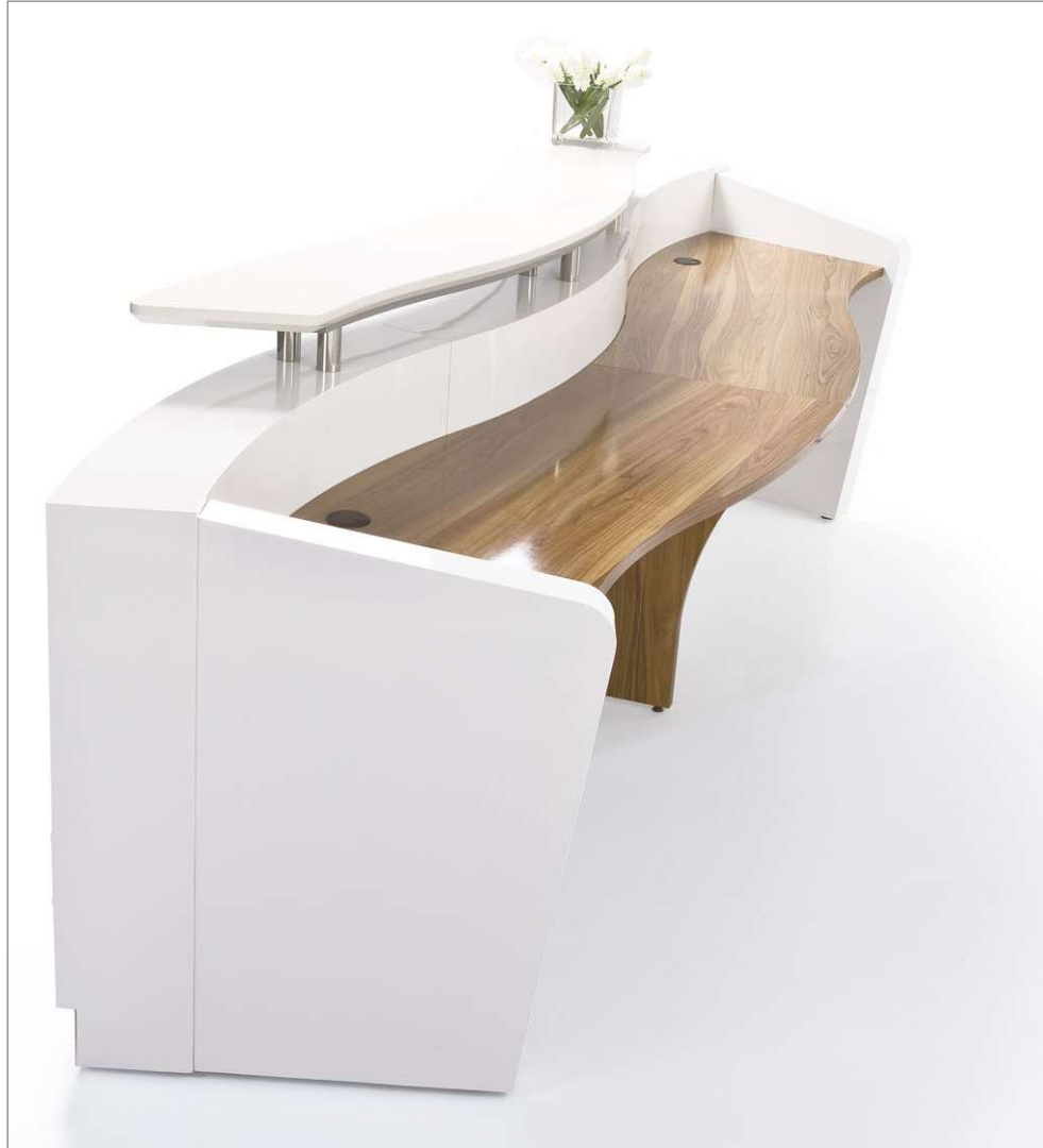
Gloss walnut desktop