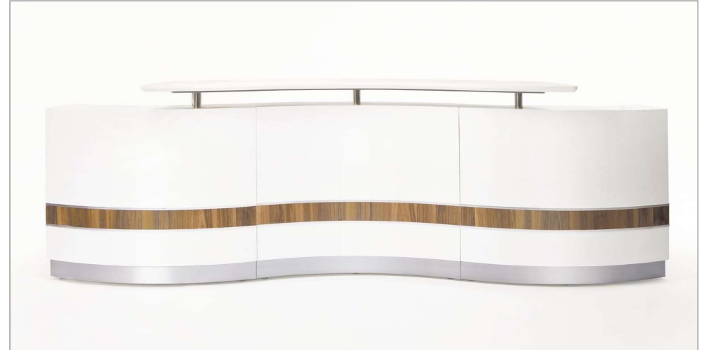
Stylish contemporary design